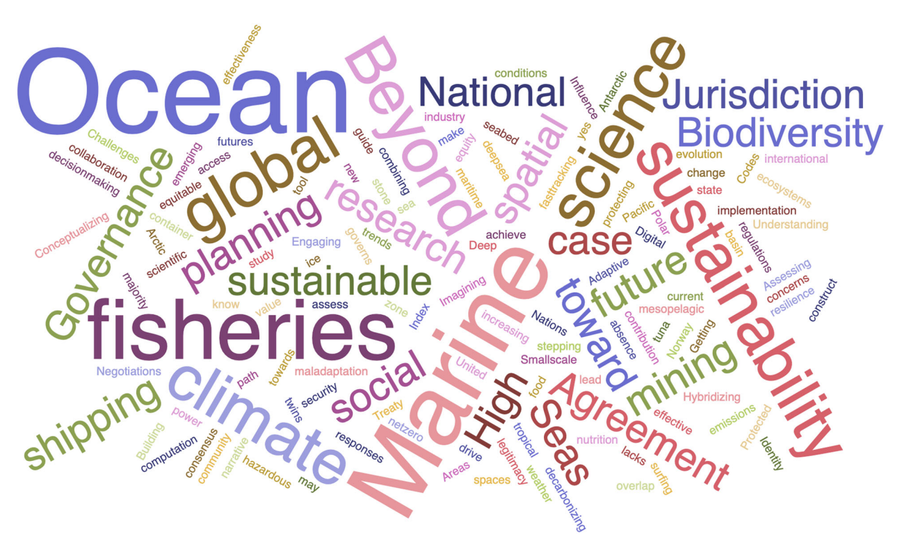
Fig. 1 Word cloud of titles of manuscripts (Articles, Reviews, Perspectives, and Comments) accepted for publication in npj Ocean Sustainability in 2022 and 2023. Data includes online and in press manuscripts by the end of August 2023.